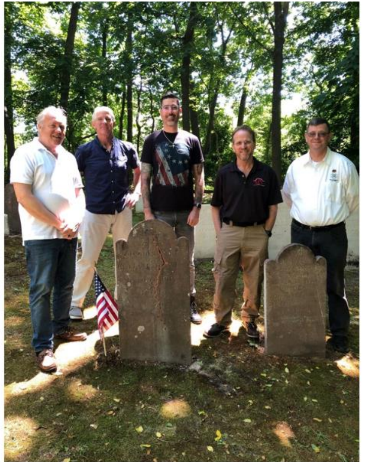
The restoration team!