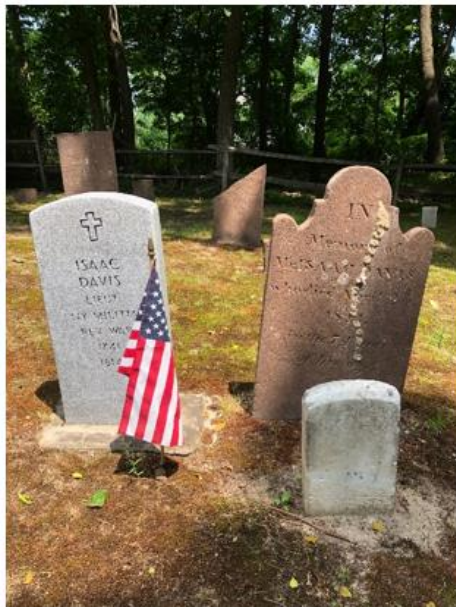
The grave of Isaac Davis, one of the 6 Patriots buried there.